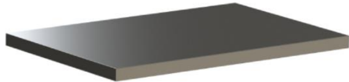
Table top without backsplash