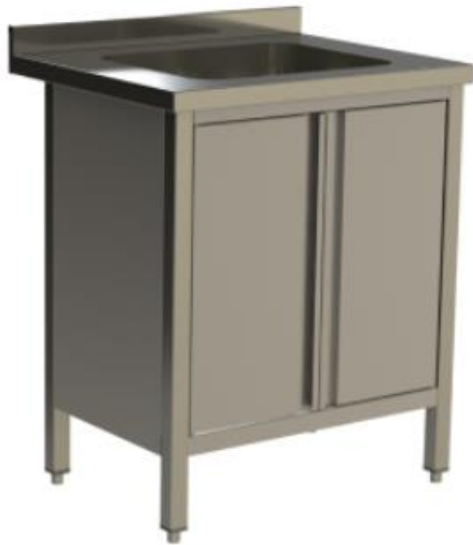
Table with sink and hinged doors