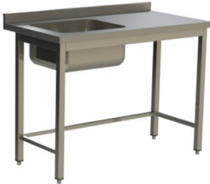
Table with sink