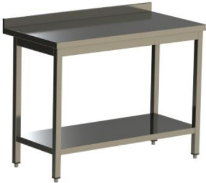
Table with shelf