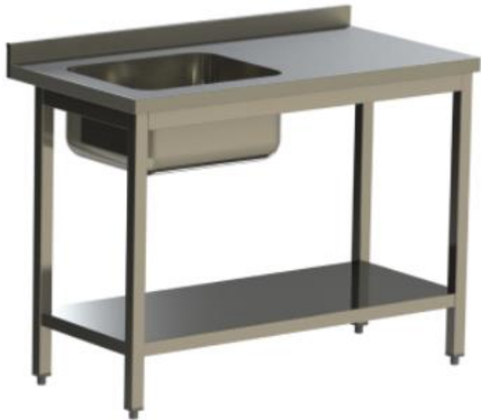
Table with sink and shelf