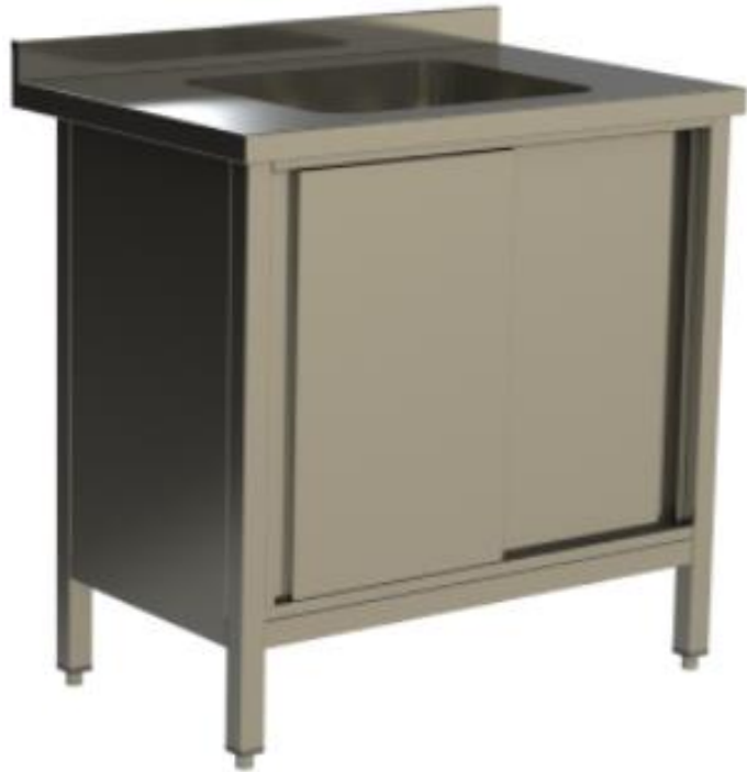
Table with sink and sliding doors