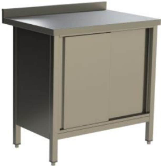
Table with sliding doors