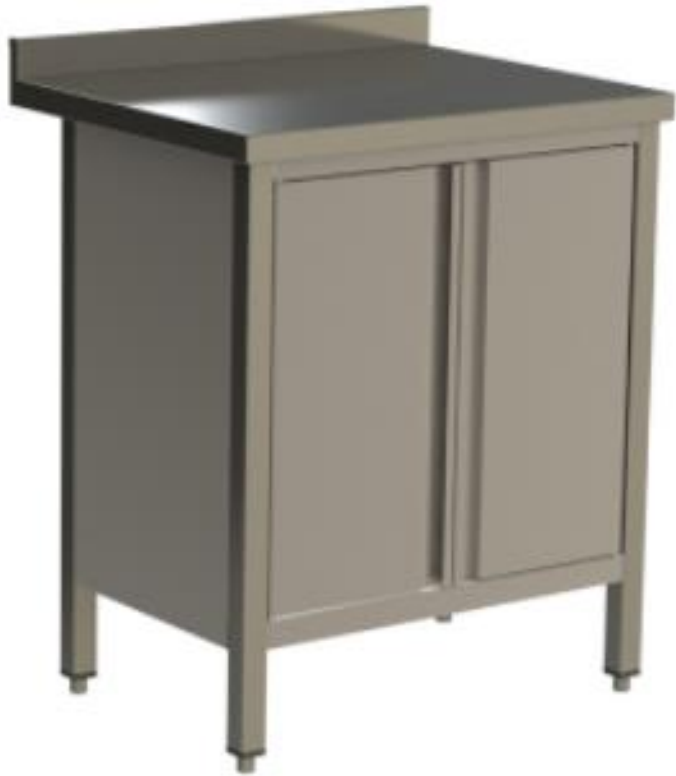
Table with hinged doors