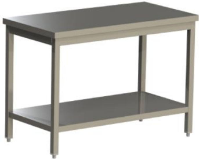
Table with shelf without backsplash