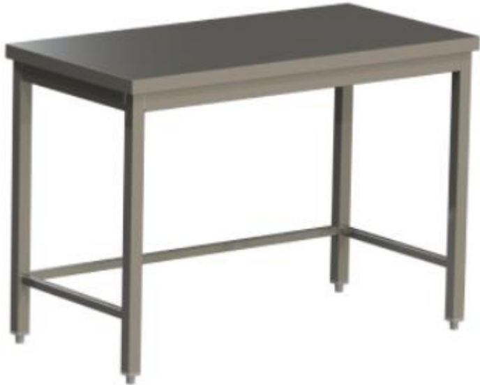
Table without backsplash